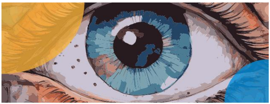
The Royal Australian and New Zealand College of Ophthalmologists 56th Annual Scientific Congress | Melbourne Convention and Exhibition Centre